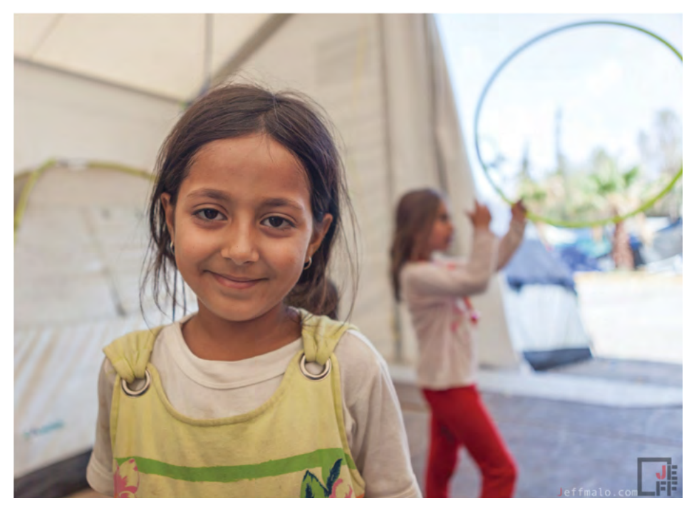
Missing Children Europe

To celebrate NEF's 40th anniversary, this case study series will illustrate European philanthropies at their best: joining forces to grow their impact and deliver unique results. Each case study will show how collaborations between foundations were developed and incubated with NEF's support. By reading about the design, approach, advantages and challenges of each collaborative, foundations will discover how they too can benefit from working more closely together.