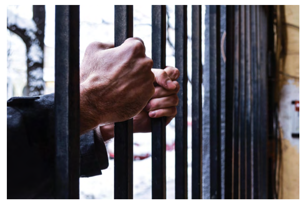
Centre for Legal Aid